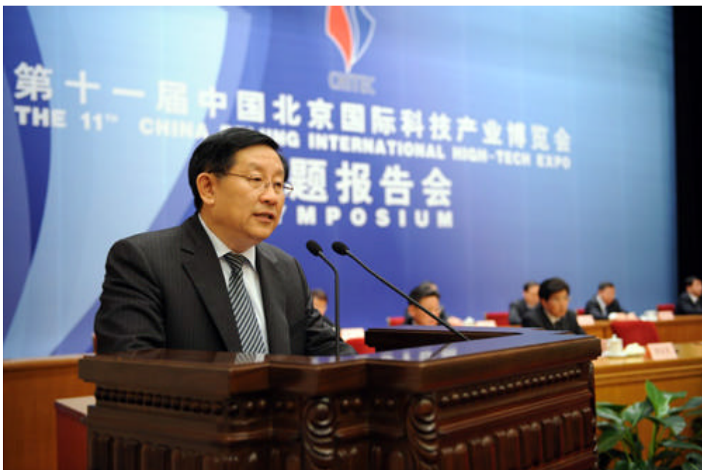
The 11 th China International S&T Fair opened on May 20, 2008 in Beijing under a theme of S&T Olympic Game and S&T Innovations. WAN Gang, Chinese Minister of Science and Technology said that China has invested at least one billion RMB in staging an S&T Olympic Game. The Beijing Olympic Game that will soon be opened in Beijing will demonstrate as a role model for responding to climate change. China will see a zero emission in the central