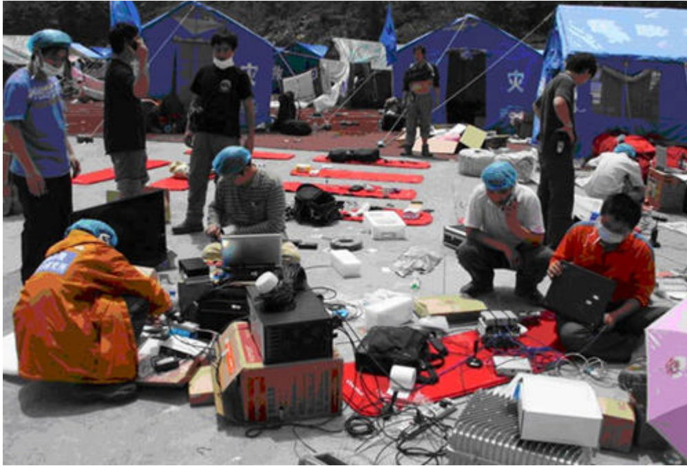
Installing the system

BSG mobile telecommunication, a key project supported by the National 863 Program, has recently put its new product, a broadband wireless multimedia system, into operation for emergency telecommunication and field dispatch at quake relief scenes. It has played a key role in saving the life of a woman who was buried in the rubble for seven days, and in providing reliable on-the-scene information for public security, fire fighting, rescuers, seismological authorities, hospitals, and mass media.